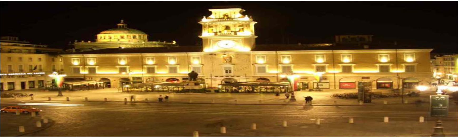
"Parma is a lifestyle, a status symbol to be proud of and to honour everyday in the respect of our ancestors" AAM