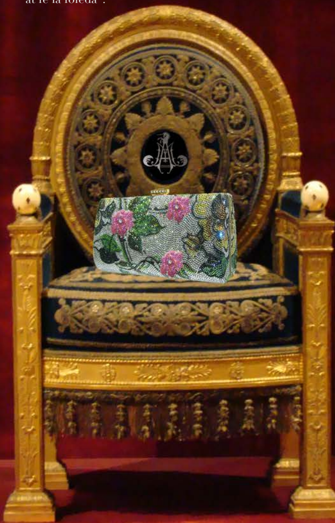
AAM is known for Hi-tech jewelry. Flowers becoming bluetooth earrings, automatic credit card holder, etc...He made a special Minaudiere to the Duchess of Cambridge.